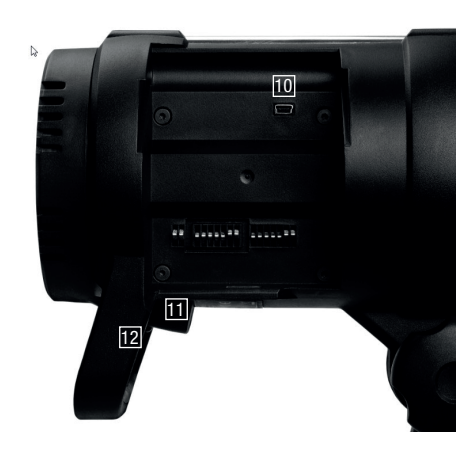
10. USB port